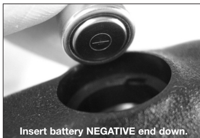
Insert battery NEGATIVE end down.