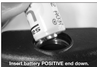
Insert battery POSITIVE end down.

R7m Battery: The R7m receiver is powered by a 3 volt (1/3 N) lithium battery. With normal use, the battery should last about six months . The negative (-) end of the battery must be inserted down .