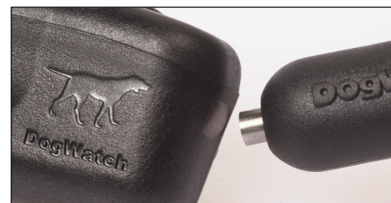
Using the magnet to reset the R7m.

Changing the Receiver Settings If you need to change the Training Level on the receiver, hold your test light magnet to the marked area on the side of the receiver. Hold the magnet steady and you will hear a series of beeps that indicate the current training level. The “Audible Only” level is one long beep, Level 1 is one short beep, Level 2 is two short beeps, Level 3 is three short beeps, etc. The Training Level will continue to advance while the magnet is held in position. When you reach the desired setting, pull the magnet away from the receiver. The receiver is now set.